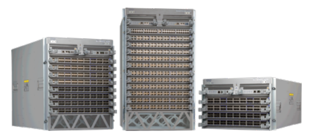
Arista 7500R3 Series Modular Data Center Switches

All components are hot swappable, with redundant supervisor, power, fabric and cooling modules with front-to-rear airflow. The system is purpose built for data centers and is energy efficient with typical power consumption of under 25 watts per 100G port for a fully configured chassis. These attributes make the Arista 7500R3 an ideal platform for building reliable and highly scalable data center networks.